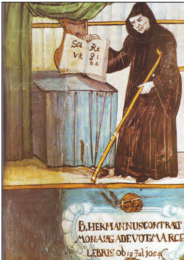
Herman of Reichenau

What accounts for the powerful influence of the Salve? The eleventh century marked the growing veneration of the Blessed Virgin Mary as a mediatrix for sinners: “To thee do we cry, poor banished children of Eve. To thee do we send up our sighs, mourning and weeping in this vale of tears. Turn then, O gracious advocate, thine eyes of mercy towards us.” After the recent millennium in 1000 AD, Christ was often portrayed as the Judge at the End of Time. Mary then became the “Mother of