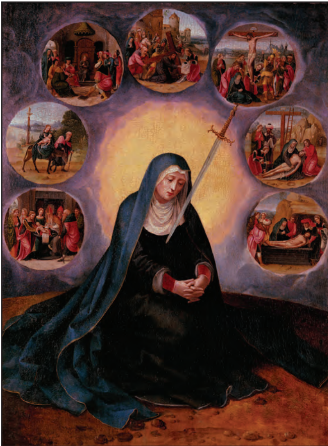
Virgin of the Seven Sorrows (Late 16th Century). By the Master of the Half-Length. National Art Museum of Catalonia, Barcelona.