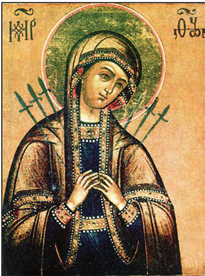
Our Lady Softener of Evil Hearts (Mid-19th Century). Russian.

Devotion to Our Lady of Sorrows raises the question of the theological and spiritual significance of Mary's participation in her Son's sufferings: namely, whether she can appropriately be considered "Co-Redemprix" with Christ the Redeemer. The question has been debated since the Medieval period, when Franciscans tended to argue for and Dominicans against the title. In the past few decades, some Roman