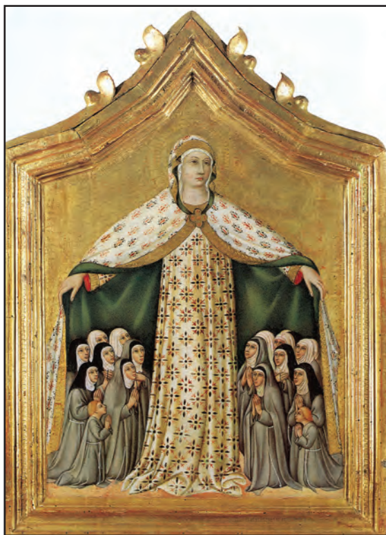
Sano di Pietro, Madonna of Mercy. 1440s. Private Collection.

Although known in the eleventh century, the Salve Regina was written down in its current form at the Abbey of Cluny, where it was used as a processional hymn on Marian feasts. It was also considered a powerful force against “temptations of the night” for monks. Cistercians chanted it daily and it was popular as an evening hymn in universities. The Franciscans picked it up early, and by the fourteenth century, many religious orders, male and female, either sang it to conclude Compline, or used it as a separate rite on its own. By the late Middle Ages, it became equally popular among the laity. Several confraternities of the Salve were founded across northern Europe where members would gather on Saturday evenings to chant the hymn. The Salve became especially