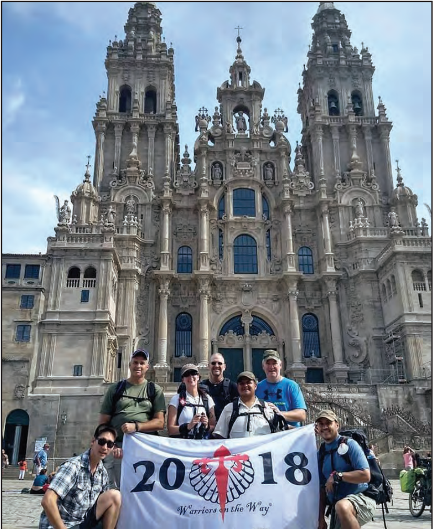
Cathedral at Santiago de Compostela